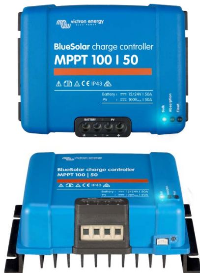
Solar Charge Controller MPPT 100/50